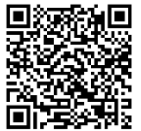
Children in Need