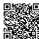
Odd Socks Day